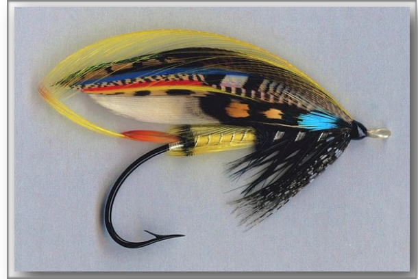
A salmon fly