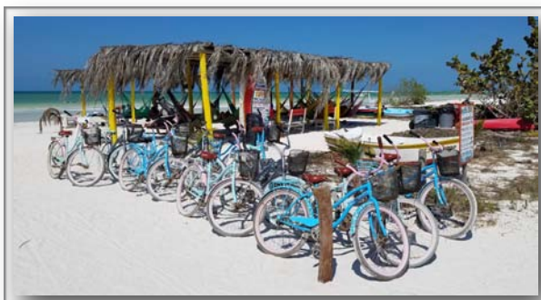
Typical beach scene