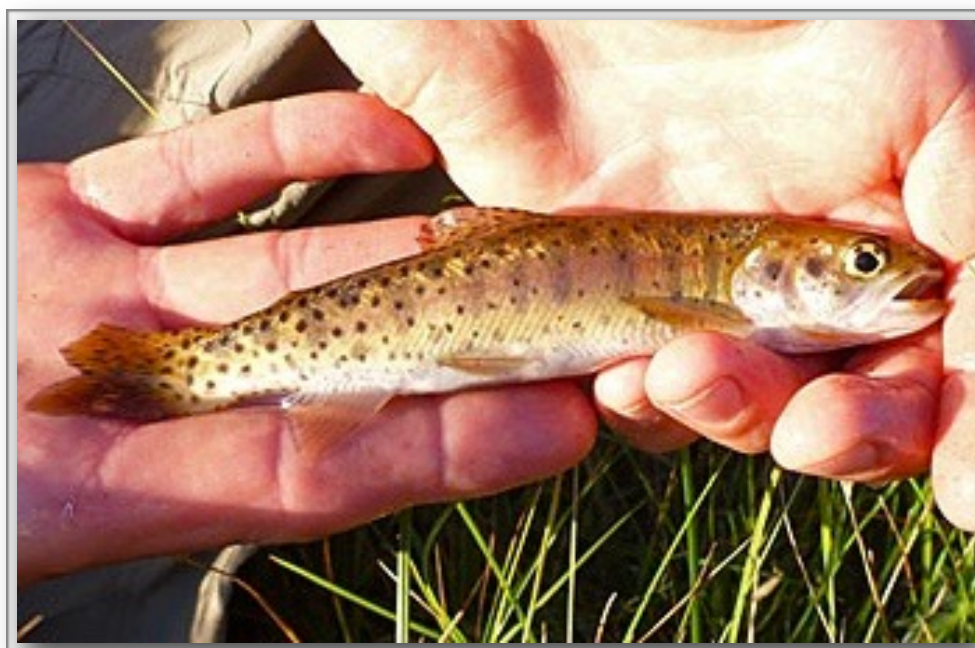
2018 Lahontan Cutthroat Trout

Treasurer, Southwest Council FFI, 1213 Sunset Place, Ojai, Ca 93023