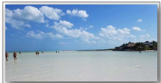
People walking the beach