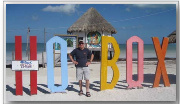
Welcome to Holbox

People come here from all over the world, but in our experience the island is very popular with Europeans. In early March, we shared restaurant tables and interesting conversations with folks from Germany, Finland, Sweden, Holland, the UK, and also Canada and India, to name a few. From your hotel in Holbox, you can walk everywhere – in sandals. Holbox is reputed to be Mexico's best walking beach and in our experience it well deserves that reputation. From early morning until night visitors and locals walk the beach or preferably