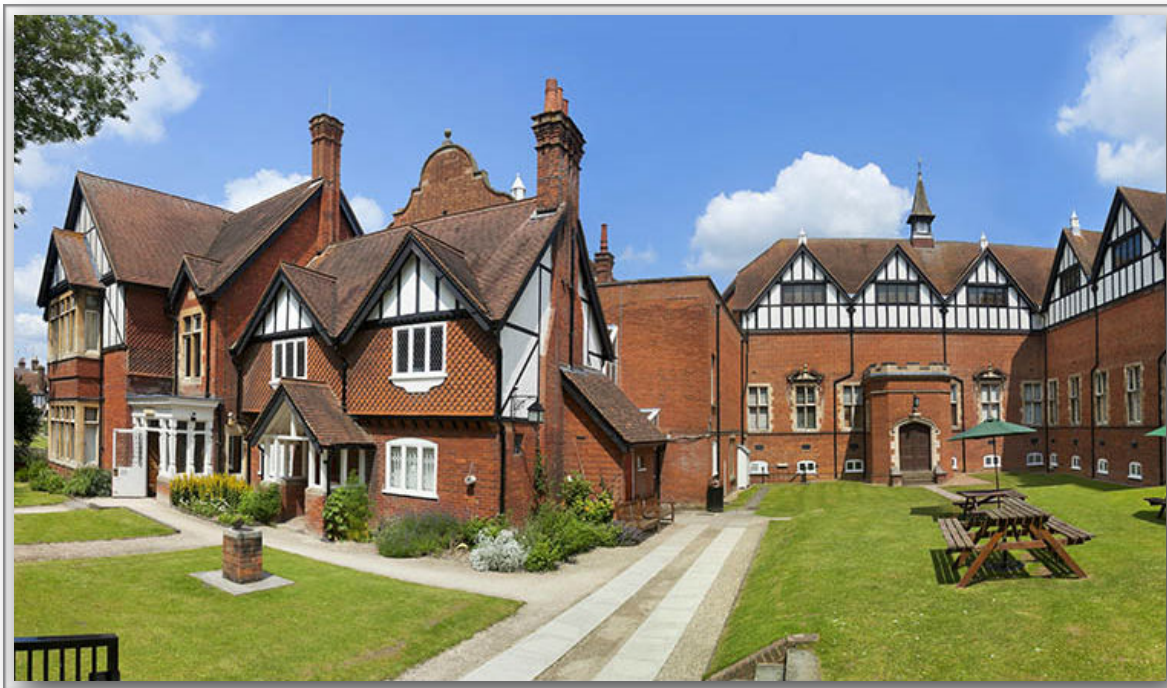
The Tring Museum

What followed was a sprawling, six-year investigation, taking me around the globe in search of Edwin, the missing skins, and some measure of justice. The Feather Thief is that account.”