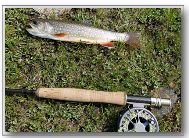
A very nice brook trout