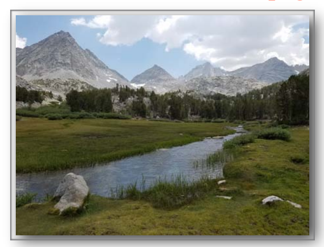
Rich Peters view of a backcountry stream